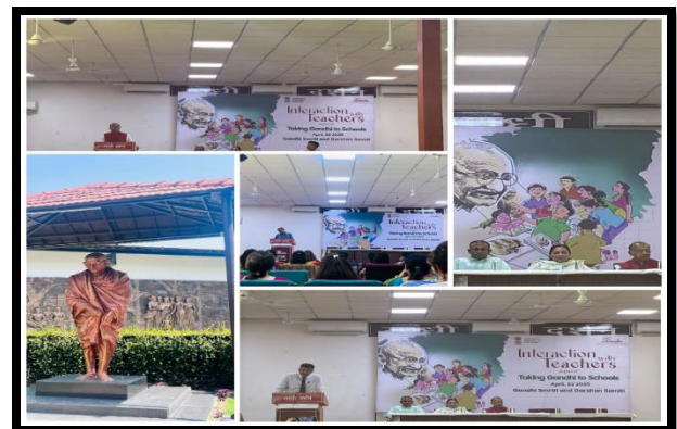
Specificity of task by the Delegates