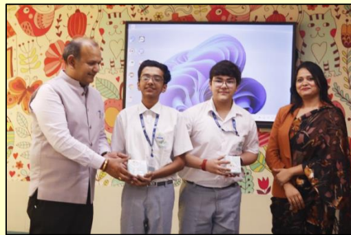
Awarding the Innovative Minds

https://drive.google.com/file/d/1syH5Nscj1C_rzm14Gj5q1Q4RHsV86cv1/view?usp=drive_link