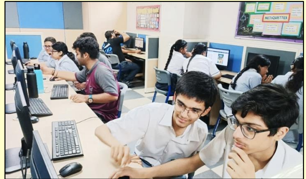
A Dynamic Platform – With Generative AI