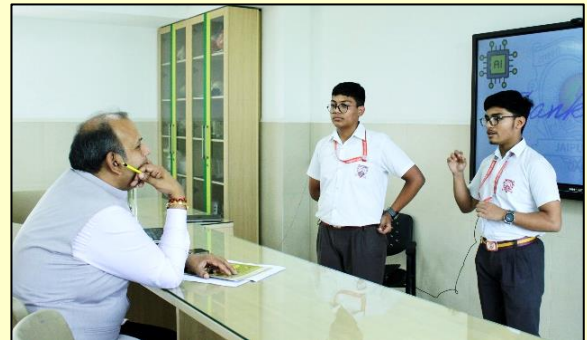
Exploring Limitless Potentials