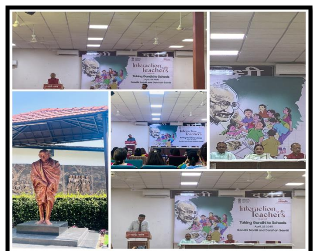
Specificity of task by the Delegates