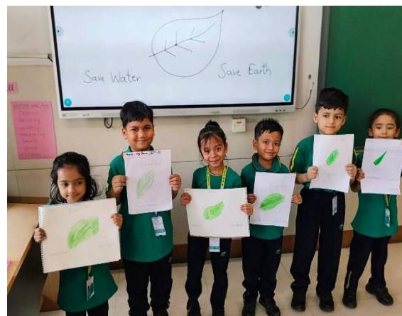
Class 1 Student's Green leaf Pledge