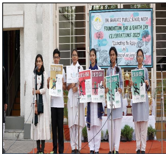
GREEN WARRIORS PERFORMING SKIT