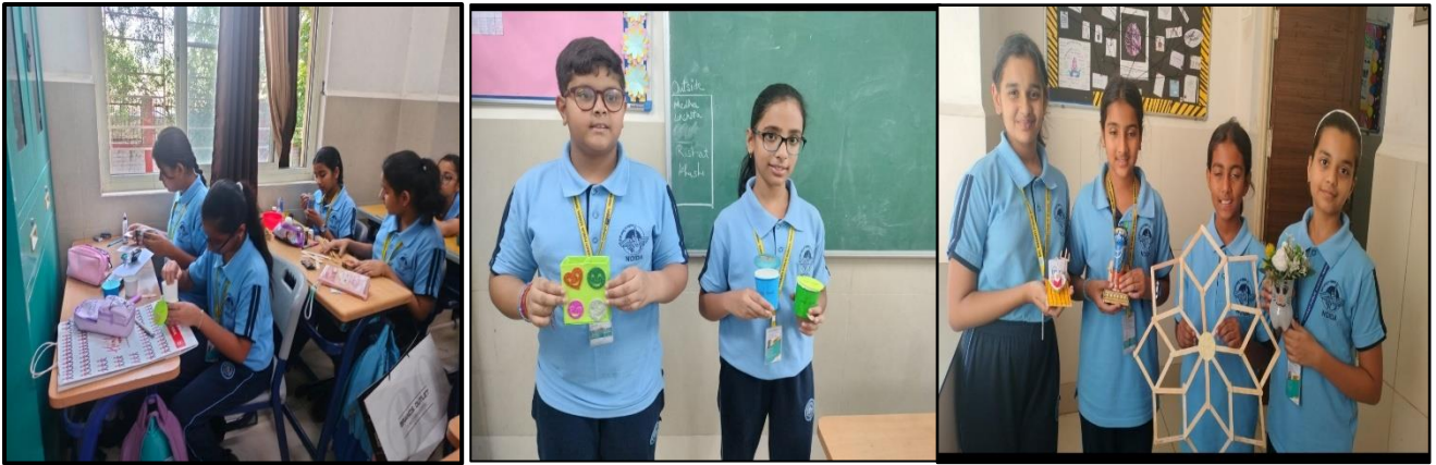
Upcycling of Waste- Class VI Green ambassadors creating useful products from waste