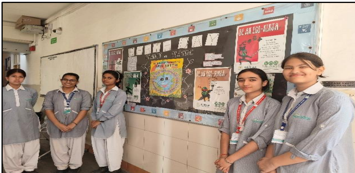
EARTH DAY INFORMATION BOARD- PRESENTATION BY CLASS XA STUDENTS