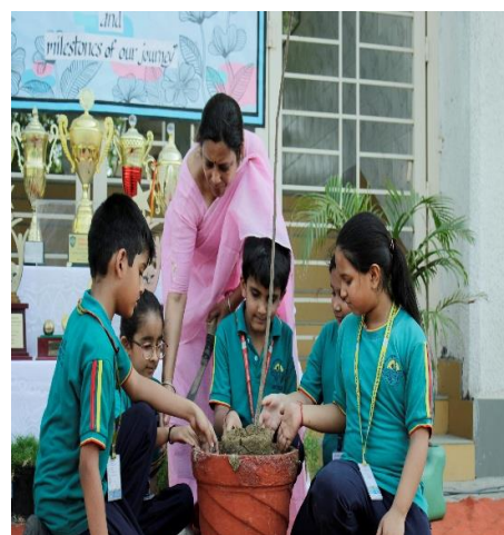
PLANTATION DRIVE- AN ACT TOWARDS GREENER PLANET