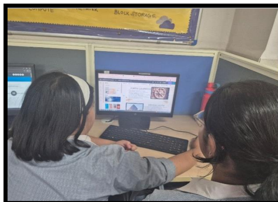
Students making Infographics using Adobe Express