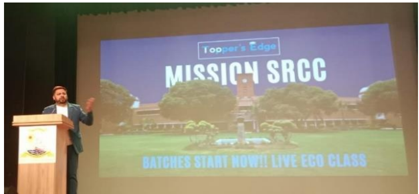
Session conducted by Topper’s Edge in association with SRCC

The speaker's ability to simplify complex economic concepts, combined with his captivating delivery, kept me engaged throughout. The interactive Q &A session was particularly impressive. It fostered a great environment for us to express our views, leading to a more