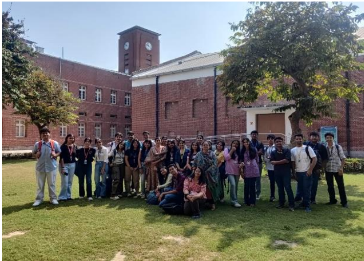
Complimentary Economics masterclass in SRCC

“If everyone is moving forward together, then success takes care of itself.” - Henry Ford