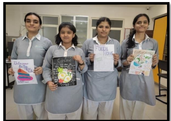
MAGAZINE COVER PRESENTED BY ALL THE FOUR HOUSE PARTICIPANTS

The covers were embody the spirit of food, showcasing various cuisines.