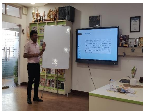
Discussion on Question Paper Pattern

As per NCF 2023, teaching of this subject should make the student be aware of the need of Economics in our day today living. A student must develop the ability to enquire and become a responsible human being.