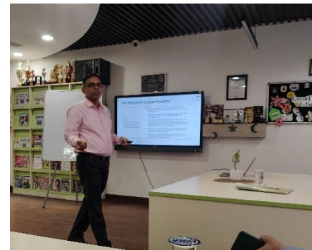
Insights on NCF 2023