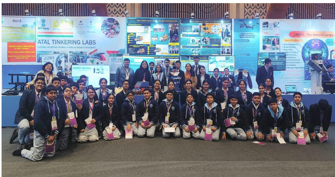
Students visit at Bharat Mandapam for Pariksha pe Charcha.