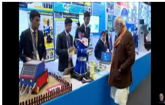
Scientific display by our students