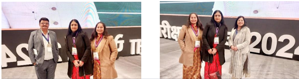
Principal and Faculty at Bharat Mandapam

Encouraging a healthy mindset, PM Modi suggested that students should compete with themselves rather than others. This philosophy aims to foster personal growth and development. The students' highly impressed reactions reflected the success of the event. Their enthusiasm and appreciation for the Prime Minister's insights showcased the event's impact on the younger generation. Parents, too, expressed overwhelming emotions during and after the event. The emphasis on holistic development and individual growth resonated well with the attending parents.