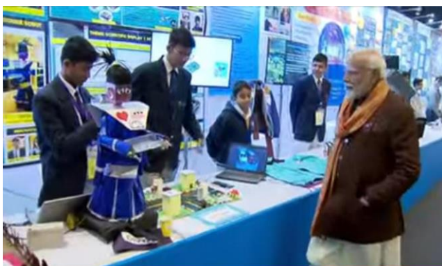
Prime Minister interacting with our students