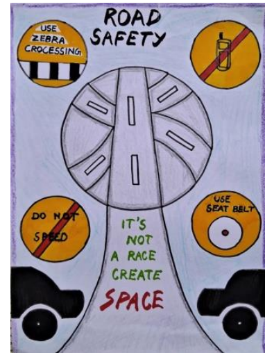
SAMAIRA – III F