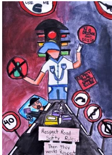
TRISHA SHANDILYA IV D