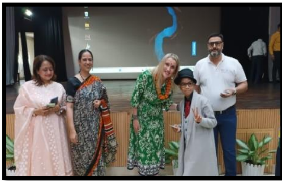
Appreciation and Accolades