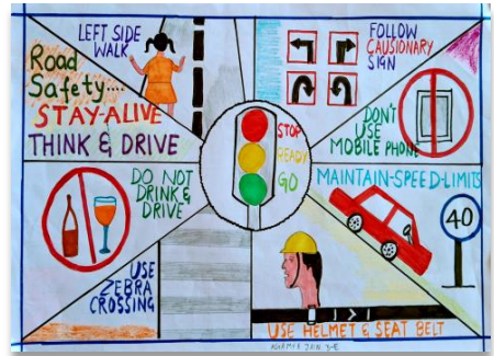
AGAMYA JAIN – III E