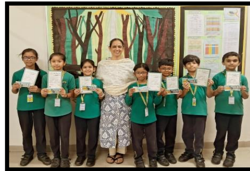
Winners - Standing out of the Crowd