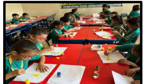
Explorers-Blending to get Beautiful greens!

Class I students were engaged to learn about primary colours and the concept of colour mixing. It encouraged creativity, experimentation and artistic expression, while teaching them an essential aspect of the colour theory. This hands on activity was both educational and enjoyable for young learners.