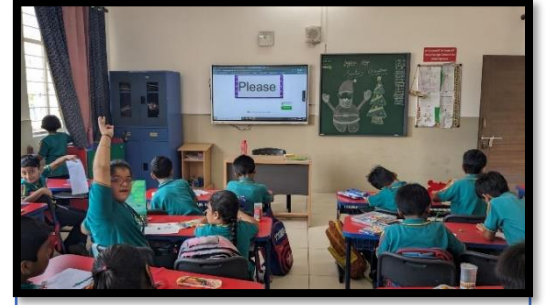
Jolly Journey into Christmas!

In a festive classroom activity, students engaged in expanding their Christmas vocabulary. The teacher presented polite words on placards/online scratch card, encouraging students to construct sentences on the board. Additionally, students showcased their creativity by drawing and coloring Santa Claus and Christmas trees, all while listing ten related words on an A4 sheet. This interactive exercise not only enhanced language skills but also embraced the holiday spirit, promoting a fun and educational atmosphere.