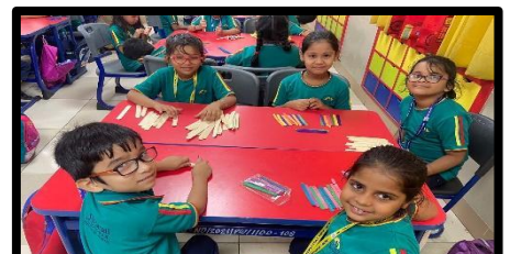
Discovering Patterns and Sequences!!

Students prepared various patterns and sequences using buttons, small sized wooden spoons, shells etc. Through hands-on exploration, they developed valuable skills in sorting and organizing, all of which are essential for their cognitive and logical development. This activity provided a fun and interactive learning experience.