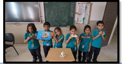
Students get creative with clay!

Second-grade students embraced the festive spirit by creating 3D Ganesh statues. Armed with cardboard, clay, or dough, they sculpted their masterpieces in the classroom. This hands-on activity promoted creativity and cultivated an appreciation for sculpting, an integral part of India's cultural heritage. (Integrated with ART)