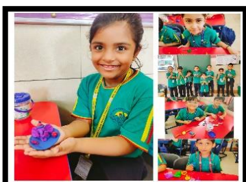
Clay creations unleashed!

Class I students created Diwali diyas and Ganesha idols and the same served as an enriching experience that combined art, culture and fine motor skill development. It allowed young learners to explore their creativity and learn about the cultural significance of these traditions. This hands-on engagement helped students to develop artistic skills and gain a deeper understanding of their cultural heritage.