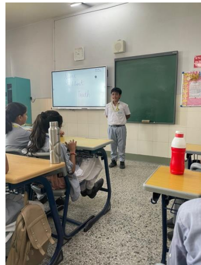
Students enjoying the Game about Truth

This was followed by the Cleanliness Drive . The students were instructed to bring a cleaning cloth, mask and sanitizer. The delighted students participated enthusiastically in the Cleanliness Drive.