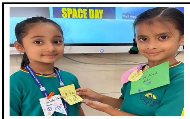
“Exchanging messages from heart to the stars.”

Based on the theme, “World Space Week” the Bal Sabha Activity “CLIP IT” (Complimenting each other) was organized for the students of classes I and II on 4 th October. The students were engaged in this heartwarming activity where they penned and swapped motivational and complimentary messages, drawing inspiration from celestial objects like “You shine like a star” and “We are planet pals,” which they lovingly affixed to their classmates’ uniforms using pegs.