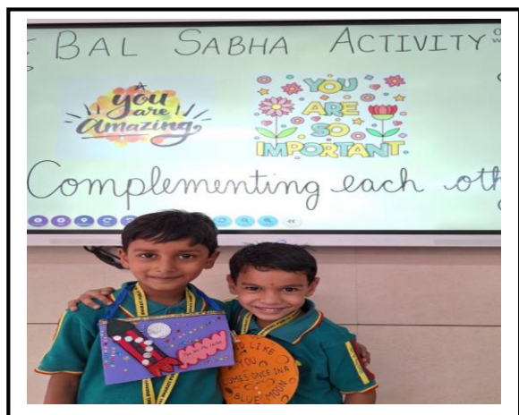
“Sparkling smiles with starry words”

The act of giving these messages to friends strengthened their interpersonal relationships and social bonds. The students in both Class 1 and 2 enthusiastically embraced the activity, and their faces were lit up with joy as they wholeheartedly strengthened the bonds of friendship.