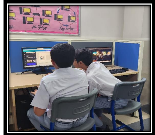
Students worked as a team