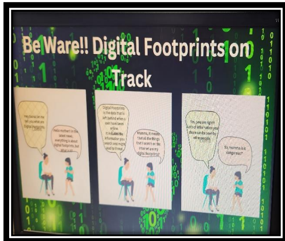
Comic Strip by a participating team