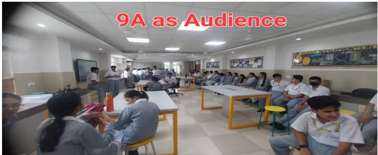
9A as Audience