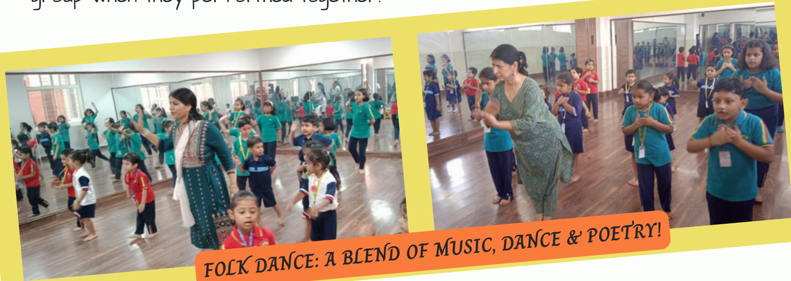
FOLK DANCE: A BLEND OF MUSIC, DANCE & POETRY!

Dandiya Raas, an energetic, vibrant dance which originated in Gujarat, often called the "stick dance" because it uses polished sticks (dandiya), was equally enjoyed by the budding dancers. The foot tapping dance steps, rhythm, eye hand coordination, body movements and expressions were learnt thoroughly by the students. The dance forms created a sense of harmony and unity within the group when they performed together.