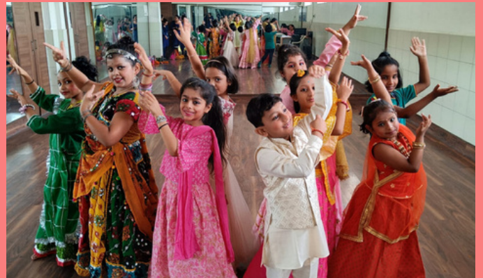
DANCE AS BEAUTIFUL AS AUTUMN SKIES