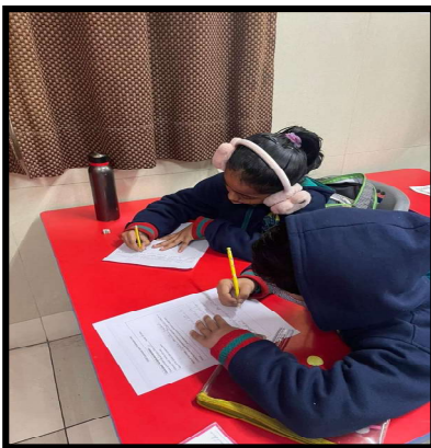
Students anticipating the digital revolutionization!

With the same vision in mind, the students participated with the belief that by making the technology central, a change will be brought, making our India... a Digital India.