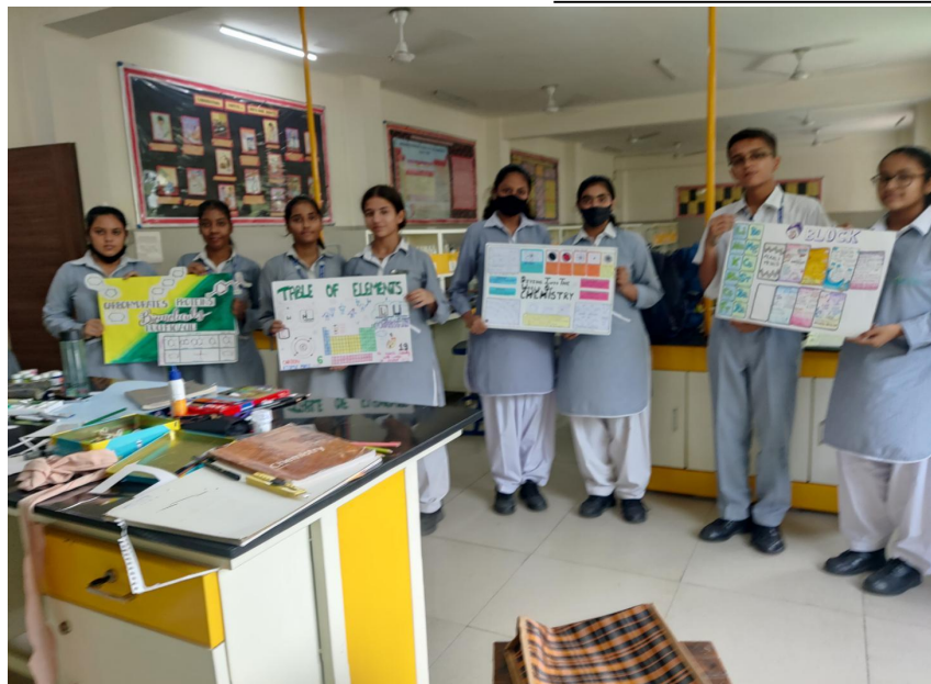
Participants with their creations

Sector - 21, Noida Phone : 0120-2534084, 2538533 / E-mail : bbpsnoida@balbharati.org Website : http://bbpsnoida.balbharati.org