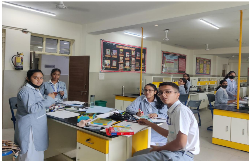
Participants at work