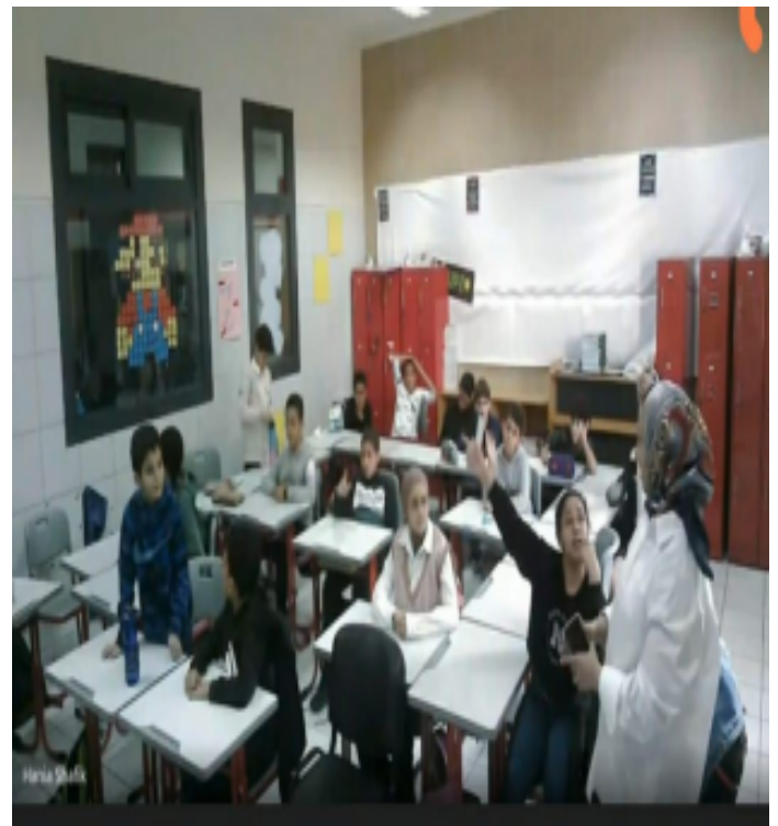
Eager to ask questions