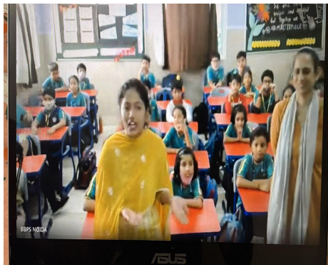
Welcoming our Turkish friends

Teachers and mentors from both the schools also interacted and enlightened the students by sharing insights about their countries. All the representatives along with the students witnessing the show participated enthusiastically and made this alliance memorable and noteworthy for everyone.