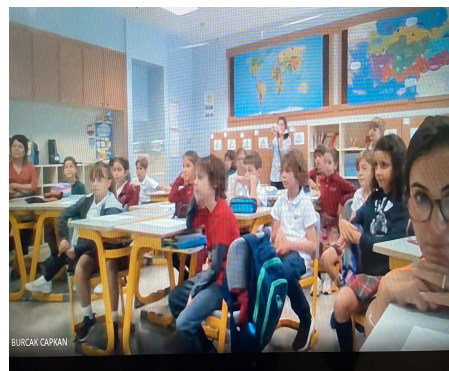
Experiencing Indian culture