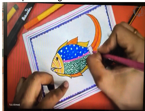
The mesmerizing "Madhubani" session