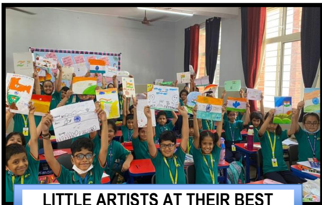
LITTLE ARTISTS AT THEIR BEST