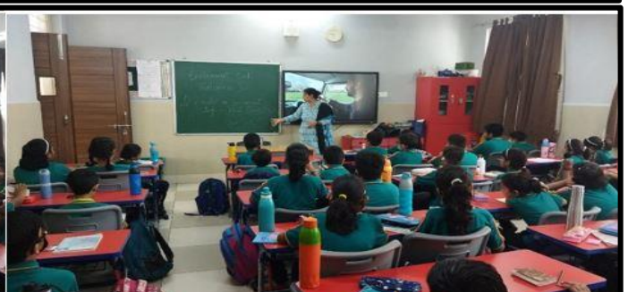
Learners gain environmental literacy and appreciation for nature while hands-on in creativity.