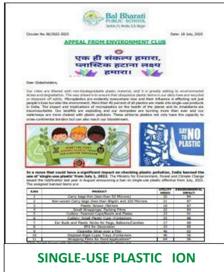
SINGLE-USE PLASTIC BAN