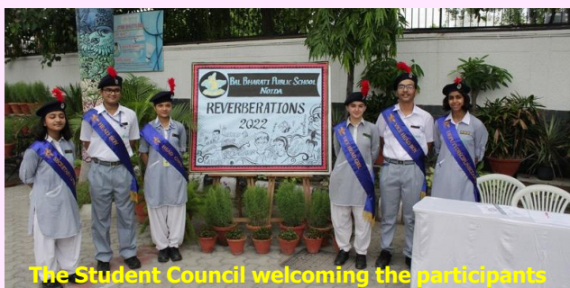
The Student Council welcoming the participants

Reverberations, this year, encouraged participants to actively engage in the urgent environmental, political and economic challenges facing our world and finding solutions to the 17 SDGs (Sustainable Development Goals) adopted by the United Nations since 2015. Unique activities leading to integration of different subjects were designed to include one or more SDGs while offering a fresh perspective to challenges faced by our world. This Mega event proved to be a clarion call to find ways to safeguard the planet and its resources, to ensure a sustainable future for all.