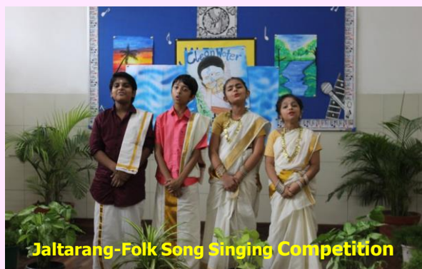
Jaltarang-Folk Song Singing Competition

The participants in all the events prepared zealously and all the competitions provided a platform to the participants to exhibit their talents and skills with enthusiasm and passion. Some of the competitions were 'Econovator' wherein the participants had to build an innovative model that helps in achieving the goal of clean energy, 'Jaltarang' a singing competition where a folk song on clean water/ importance of clean water from any state of India was to be presented, 'Doodling Under Water' wherein the students had to create doodle art on " Hidden Life Below Water", 'Fitness Ka Doze Adha Ghanta Roz' wherein the young athletes had to create a fitness video together, along with a jingle on fitness, Street Play (NukkadNatak), spreading awareness about the importance of gender equality, zero hunger, 'Rhymobate', a debate which concluded with rhymed couplets which highlighted the importance of Gender Equality.