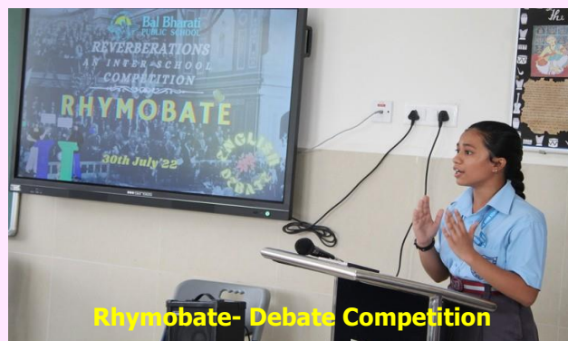
Rhymobate- Debate Competition

On 30 July, 2022 the valedictory ceremony was conducted in the online mode. All the participants and their mentors were congratulated for their competitive zeal and enthusiasm. The winners of all the competitions were announced and applauded.