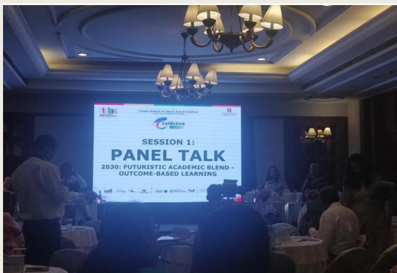
ACCEPTING VARIED PERSPECTIVES