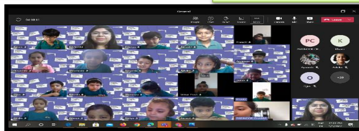
CLASSROOM DISCUSSION AND PRESENTATION