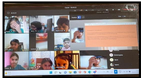
Reading along with teacher