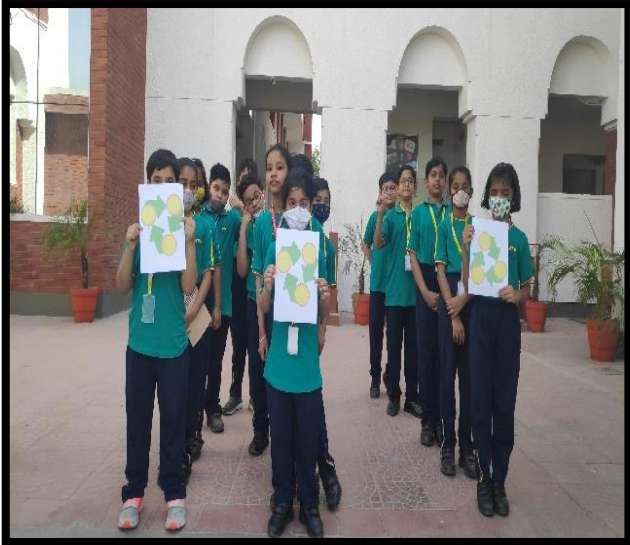
GEARING UP FOR THE HUNT