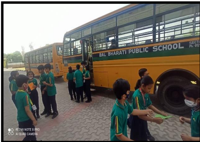
SOLVING THE RIDDLES