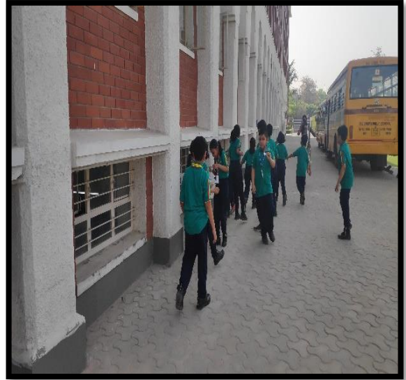
FINDING THE THREE RS