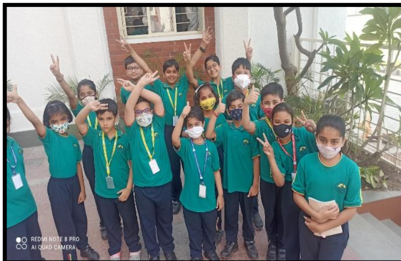
A HAPPY GROUP PICTURE.