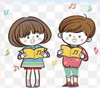
Reciting & Singing Together