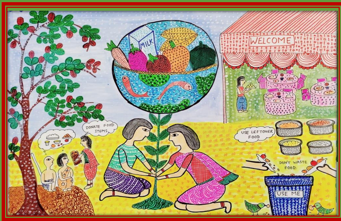
AATMAN AKSH (3 B)