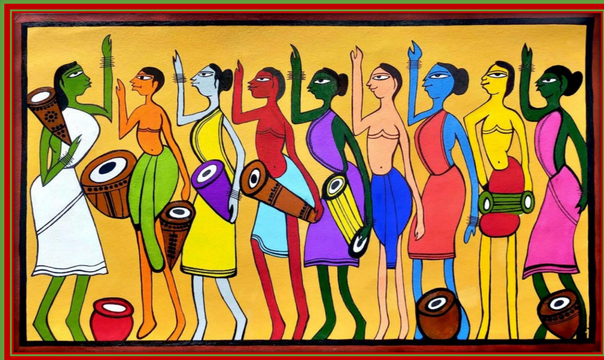
SRISHTI KATHAIT (11 D)

Santhal Paintings are done in primary colours and are enhanced with leafy patterns in the foreground, background and borders. These paintings are characterized by a child like simplicity in the depiction of birds, animals and insects. The figures are static, frequently multicoloured, artistic rather than realistic projections.