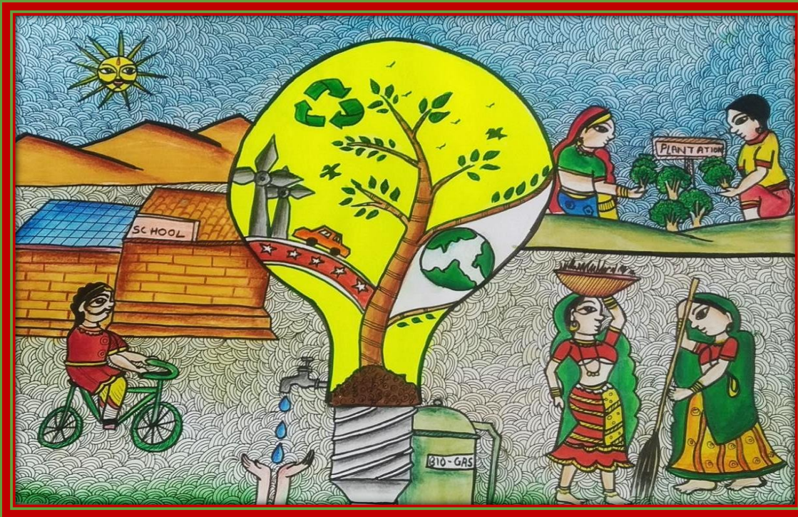
JIGNASA SRIVASTAVA (8 C)