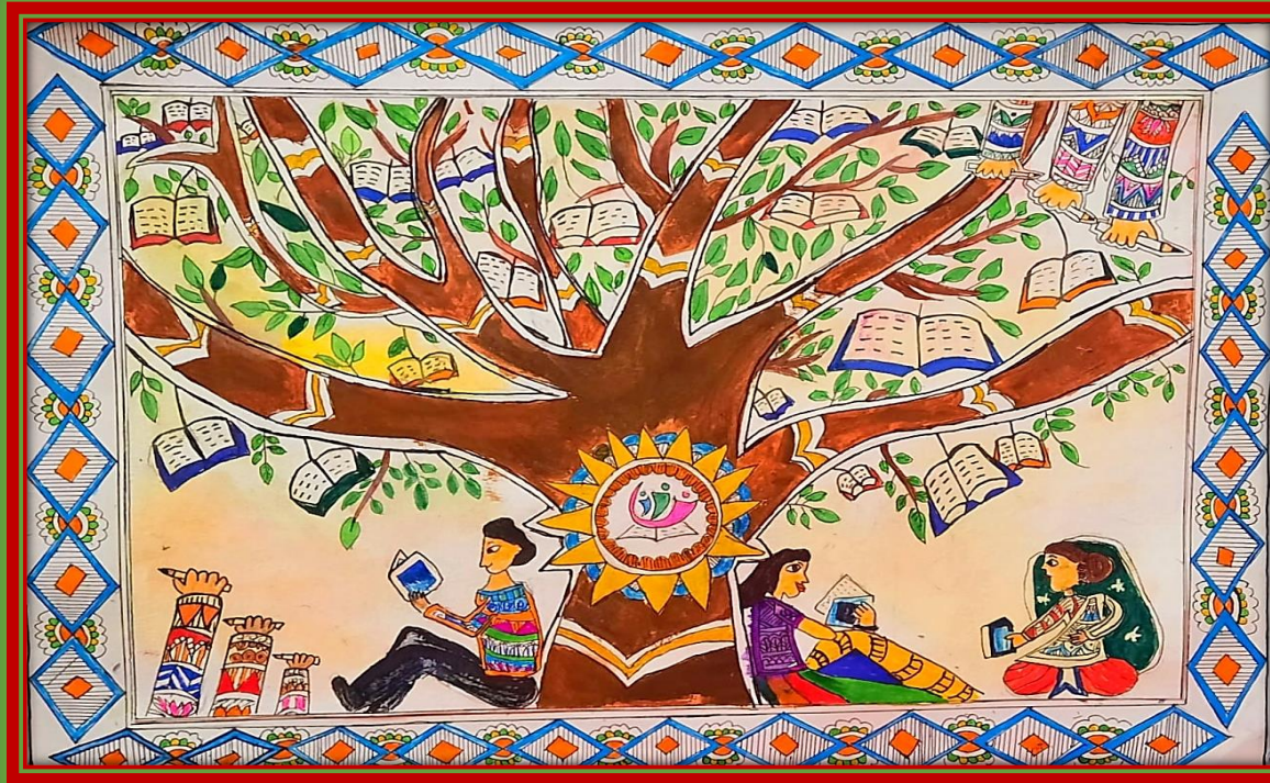
KHYATI (7 A)

"To learn to read is to light a fire; Every syllable that is spelled out is a spark."