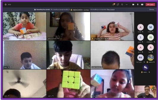
RUBIKS' CUBE CLUB