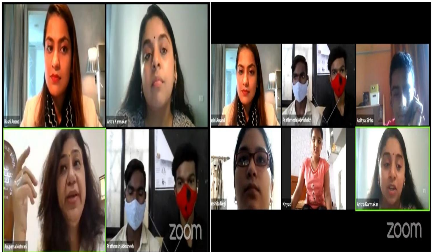
GLIMPSES OF THE WEBINAR