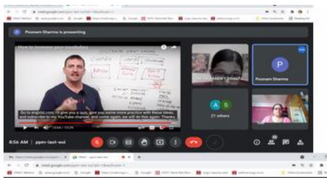
Learning to frame words using different Parts of Speech