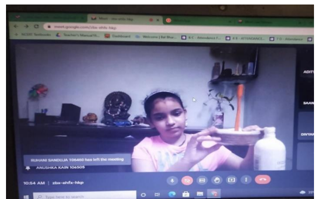
'Hands on Session -The Nest Making Activity'

'Tell me and I Forget. Teach me and I Remember. Involve me and I Learn'.