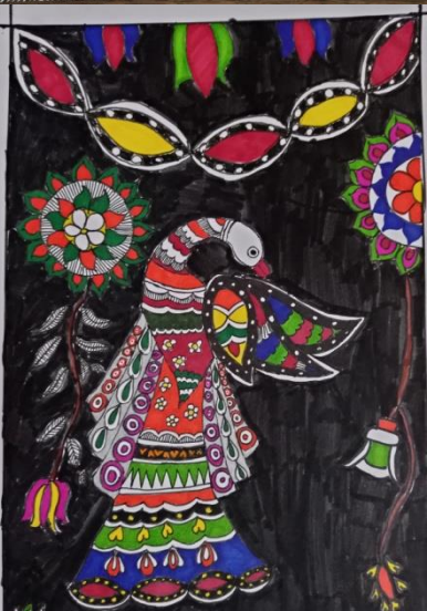
Peacock in Madhubani