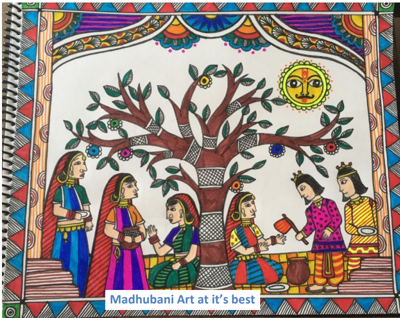
Madhubani Art at it's best