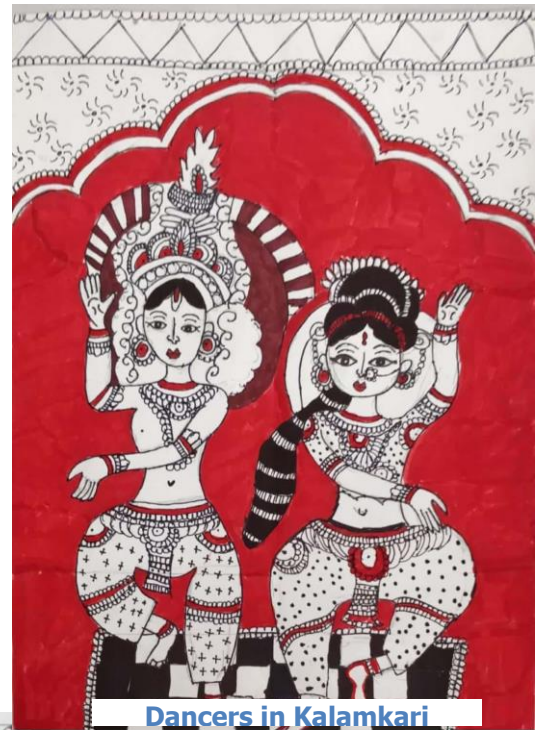
Dancers in Kalamkari