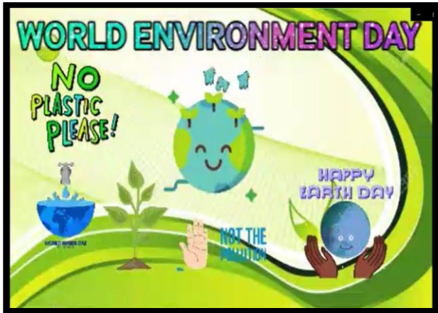
PRANSHU KESHRI IV-D