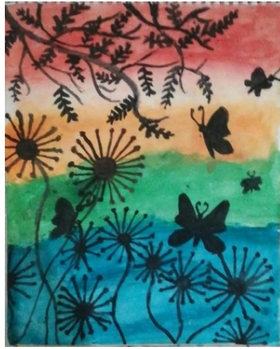
Arush Patel Class-VII_-D