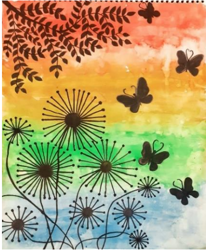
Avika Gaur class VIII-A