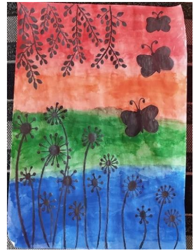
Shraddha Mourya VIII