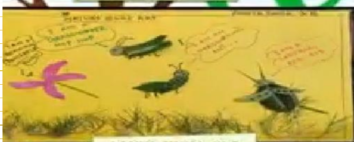
AANYA SINHA III-B