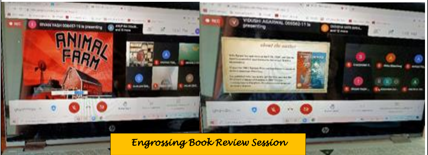
Engrossing Book Review Session