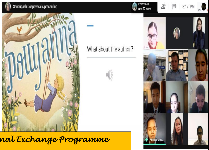
International Exchange Programme