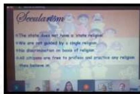
In the midst of discussion on 'secularism'