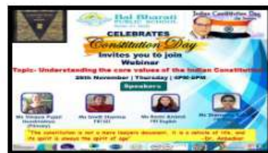
Webinar invite of 'Constitution Day'