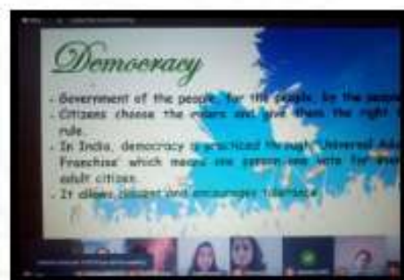
Sharing facts and insights on 'democracy'