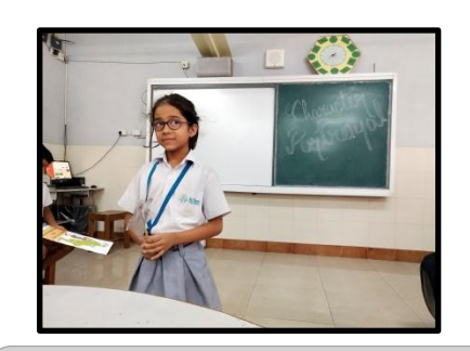
Manikarnika portrayed in the cutest way.