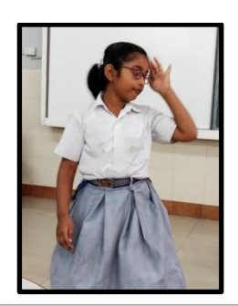
CINDRELLA LOST IN HER THOUGHTS.