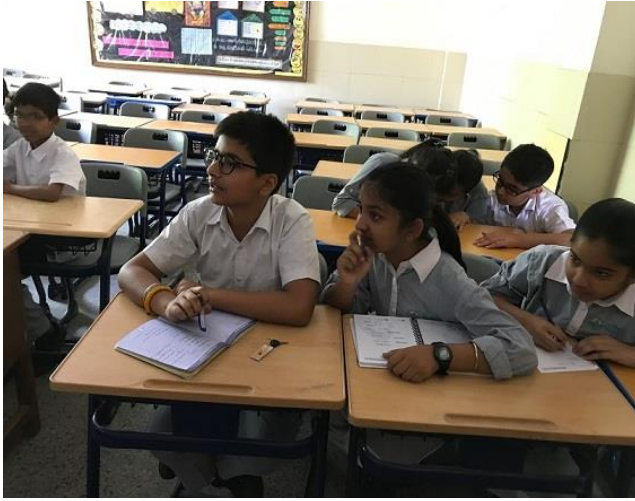
optic clues for Jumble Tumble