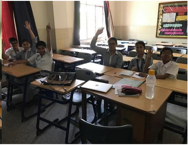
The Interactive Spellers