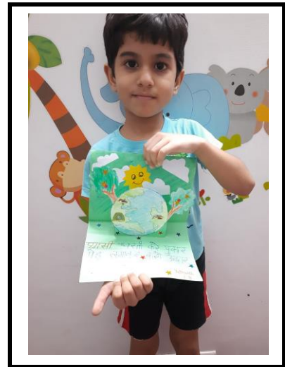
“Save Mother Earth”