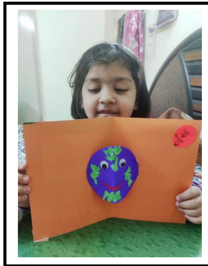
“I love my planet”