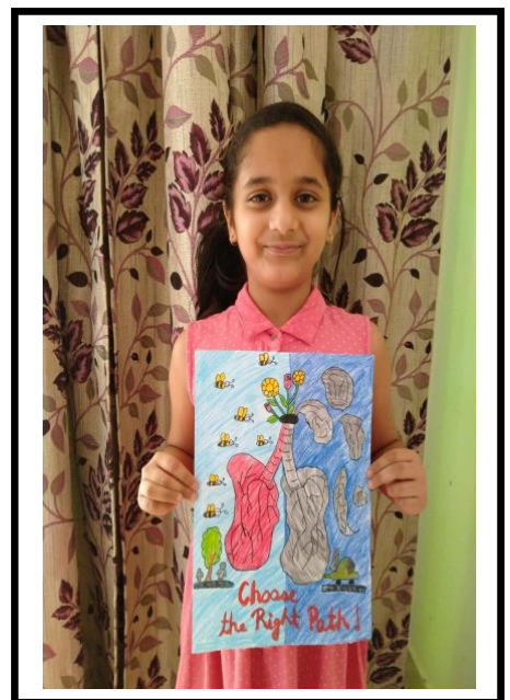
Our Young Performer!!!