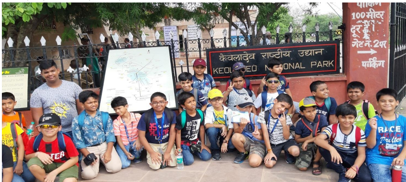
THE YOUNG BIRD WATCHERS

The students and teachers started for the trip at about 5:30 AM in comfortable AC-Coaches. After a brief stopover for breakfast near Jewar Toll at the Jollygo food court the coaches drove on and reached the Shiv Vilas Palace Resort in Bharatpur at about 11.45 AM. The serene surroundings of the resort and the relaxing environment of the resort removed any vestiges of fatigue. Soon we were ready to embark on a sightseeing safari. Travelling in a convoy of rickshaws, the students were excited to spot exotic birds from different parts of the nation. The safari was nearly three hours long, after which everyone returned to the resort for a dance party followed by a sumptuous dinner, which brought the wonderful day to an end.