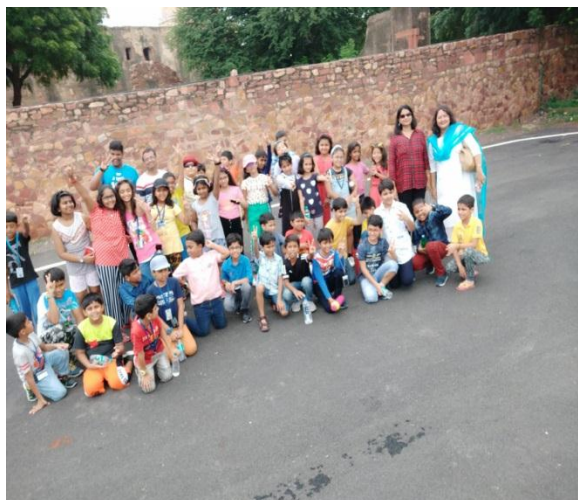
ENTHRALLED BY THE BEAUTY