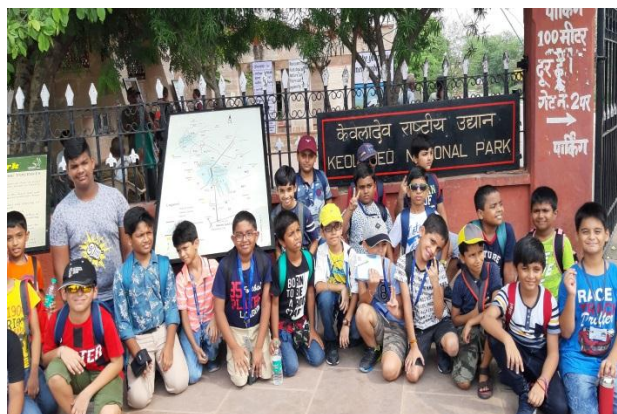
HAPPY AND FRESH

Excursions form an integral part of educative experience. Not only students discover new places they also learn self-reliance and taking care of themselves in an independent manner. As a part of this experience, an excursion to the famous Bharatpur Bird Sanctuary was organized on 24 and 25 August 2019. A total of 41 students from classes IV to VI, accompanied by four teachers went on this memorable trip.