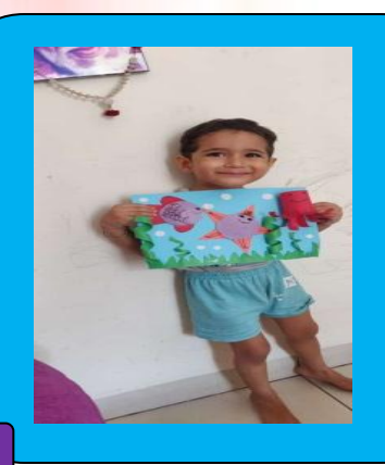
Agua World (3D Craft)