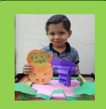
Animal World (3D Animal