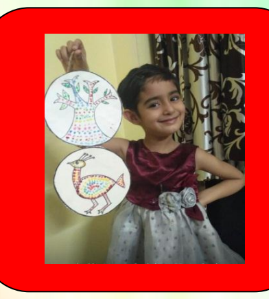
BhilArt with Earbud