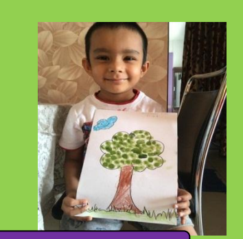
Story: The Sky is falling, Activity-Finger Printing