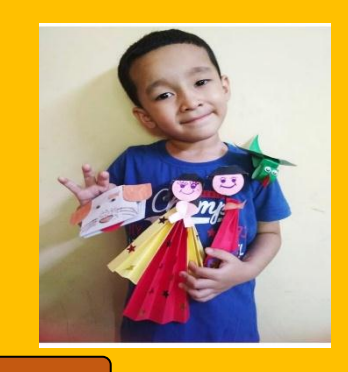
World of Puppets 'Me and My Pet' (3D