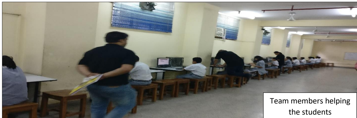
Team members helping the students

The response of the students for classes was overwhelming and they were excited to be a part of the session.