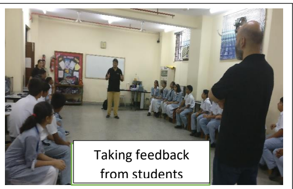
Taking feedback from students