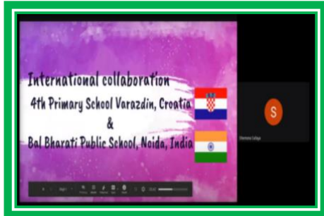
A delightful cultural exchange between India and Croatia