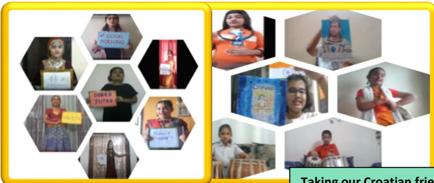
Our avid lot dressed in ethnic clothes greeting in their regional dialect