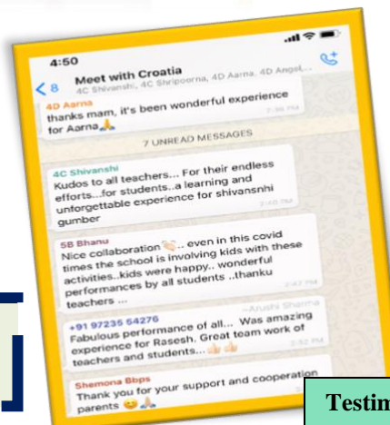
Testimony by the parents