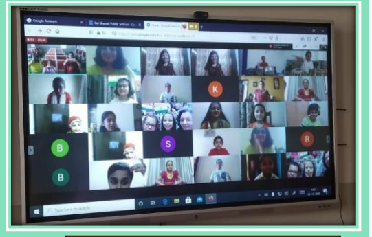
Exchanging smiles and ideas