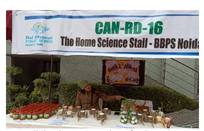
Stall displaying Hand Crafted Products

The students of Home Science worked as budding entrepreneurs by preparing and displaying jute reusable bags to limit the use of plastic bags, decorative sauce bottles with money plants to initiate the habit of keeping indoor plants, horse cart made up of jute, hand- made paper cord cycles and mixed vegetable pickle.