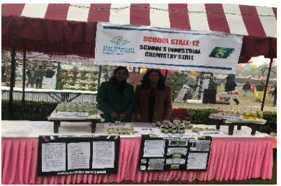
Display of Industrial Chemistry