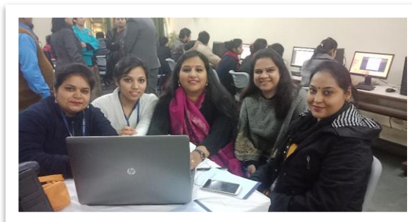
Team Work – First SWAY

We as a team were assigned a task of creating our first sway and presenting it before the audience. It was a great session as we all got to learn something new and interesting. The quiz on MS Office was given as a group activity and it was fun solving the questions together.