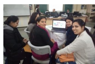
Mindmaps using www.mindmups.com

Different Video Conferencing software like Google Hangouts, Skype etc were discussed in detail and a live hangout session was demonstrated by the resource persons. Importance of Blogging and online tools for creating mind maps were discussed. The resource persons explained how this software can be used to teach students different topics creatively.