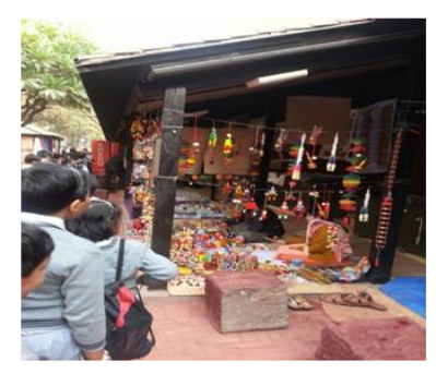
Viewing the arty facts