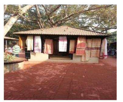
Display of stall from Assam