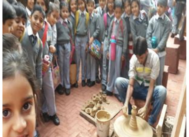
Enjoying the potter's wheel