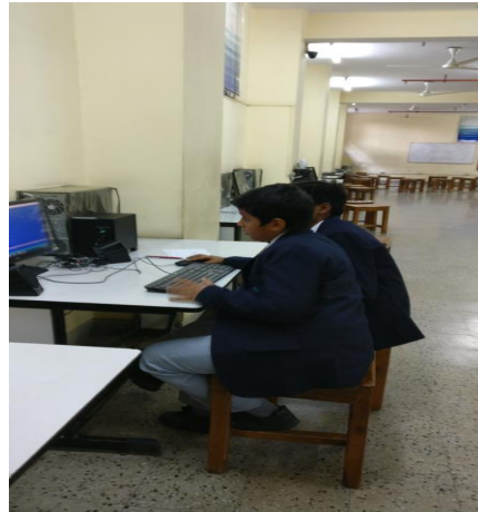
Bringing out the best in them...