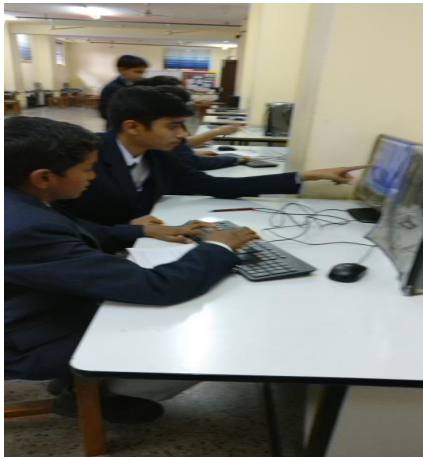
Creative Minds at work...

Sector – 21, Noida Phone : 0120-2534064, 2538533 / e-mail : bbpsnd@yahoo.co.in Website : http : www/bbpsnoida.com