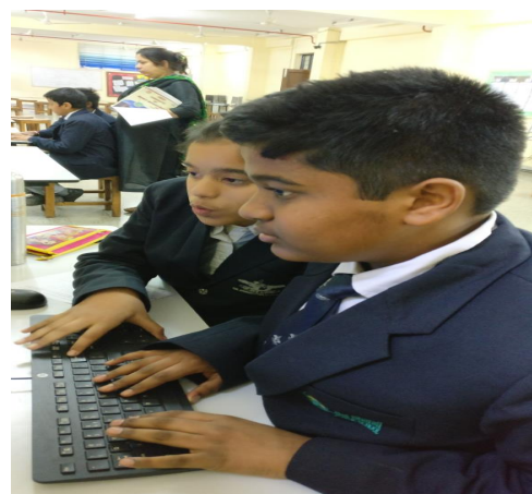
Judgement in progress...